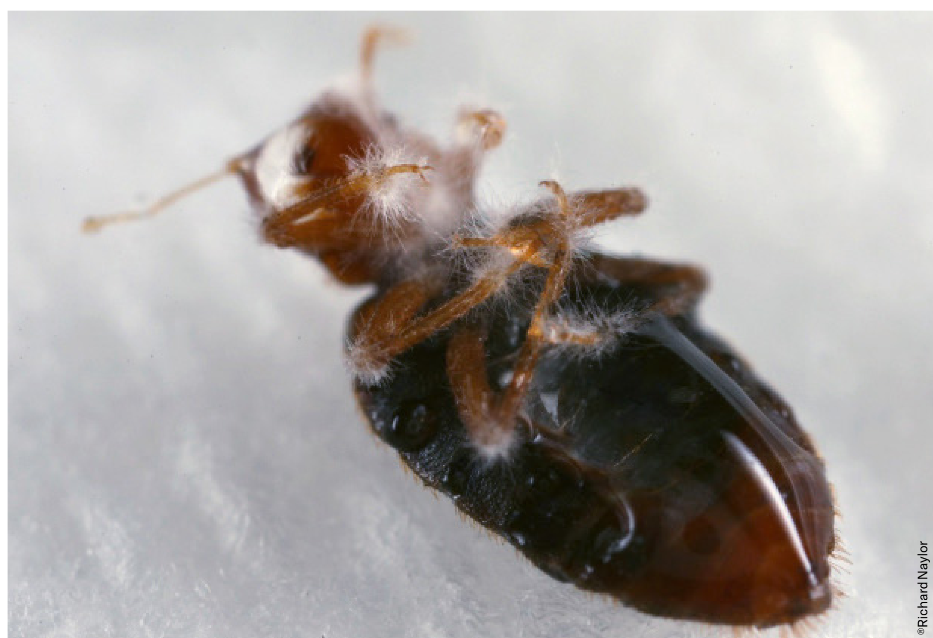
Dead bed bug ( Cimex lectularius ) showing mycosis by Beauveria bassiana